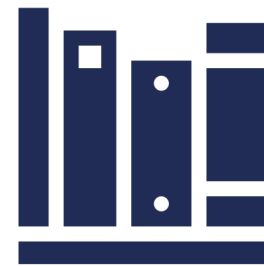
Exam Prep References