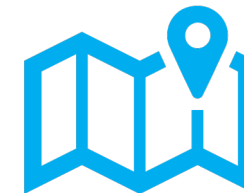
8-Week Prep Circuit